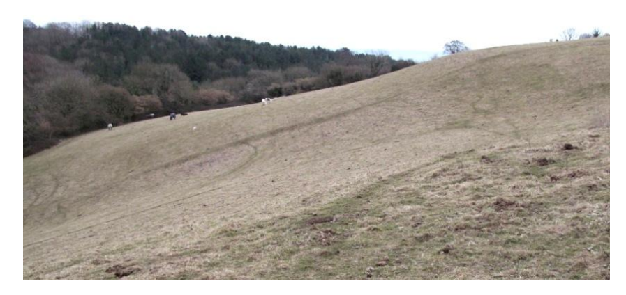
Beer Fields CWS