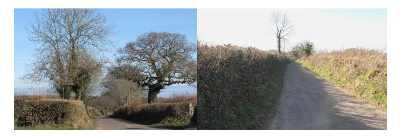
Hedgerows within Beer parish