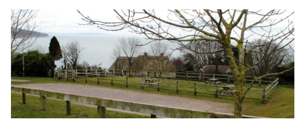
Picnic area in Cliff Top long stay car park

Within the large grassy area of the Cliff Top long stay car park there is a fenced-off picnic area with picnic benches. Most of the extensive grassy area is grass-dominated and not diverse, with perennial rye-grass, cock's-foot, annual meadow-grass and daisy being the predominant species. The grassy banks by the picnic area were slightly more floristically diverse and included ribwort plantain, germander speedwell, selfheal, lesser celandine, buck's-horn plantain and mouse-ear. There were four young ash trees to the north of this area.