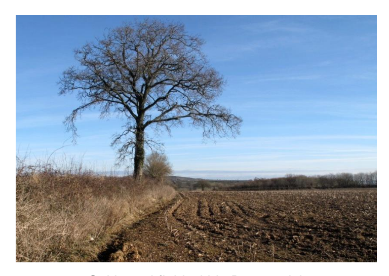
Cultivated field within Beer parish