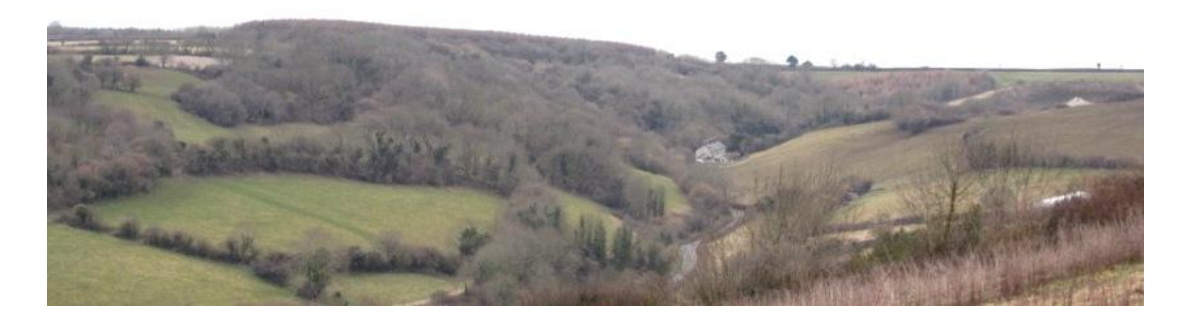
Beer Quarry and Caves CWS in distance