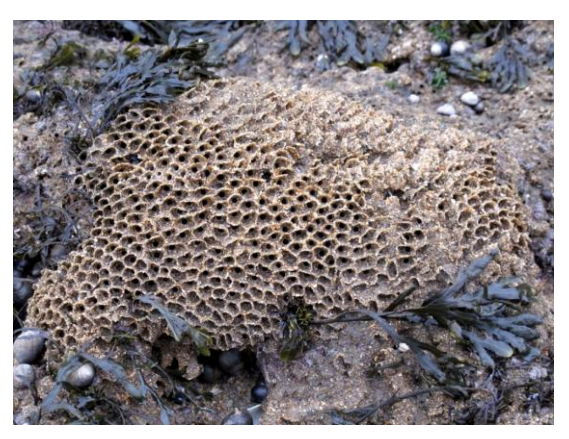
Honeycomb-worm reefs (above) Intertidal rocks at Beer (right)