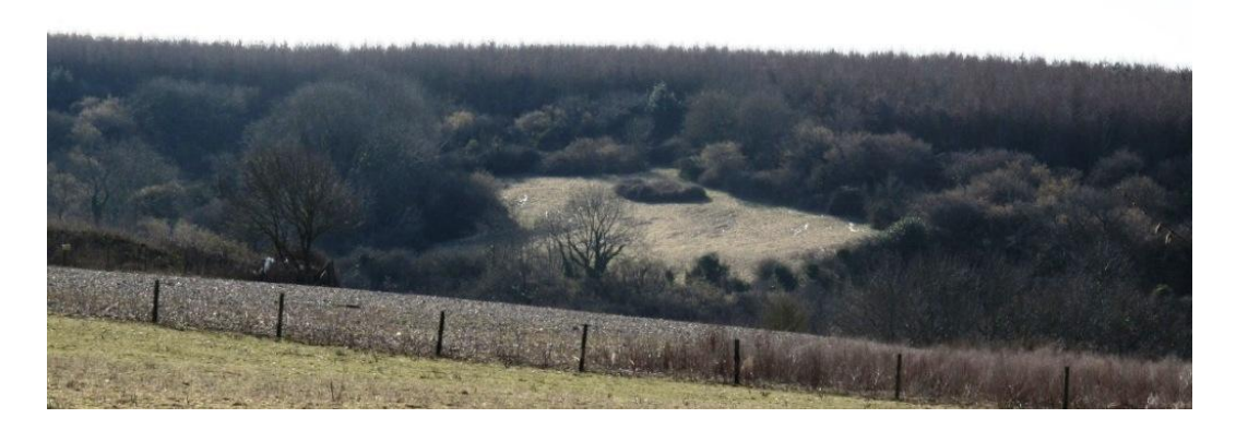
Beer Quarry and Caves CWS