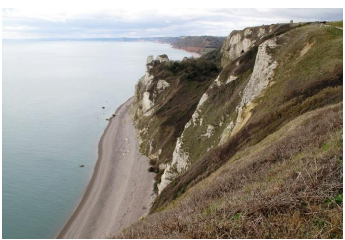
Coast near Beer Head

Sea cliff and slope (Devon BAP); Maritime cliff and slopes (UK BAP)