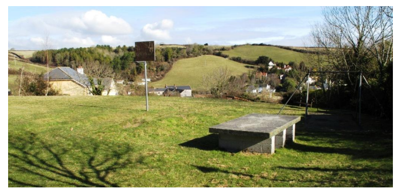
Ashill Children's Play Area

The main grassy area is managed as mown amenity grassland, with three trees in the north-west corner. The grasses included perennial rye-grass, red fescue and cock's-foot. There were few herbs, mainly daisy with occasional creeping buttercup and ribwort plantain. There was also some yarrow on the bank in the east of the site. Other plant species recorded here around the perimeter included cow parsley and wood avens. Rook, blue tit, robin and great tit were noted during the site visit here.