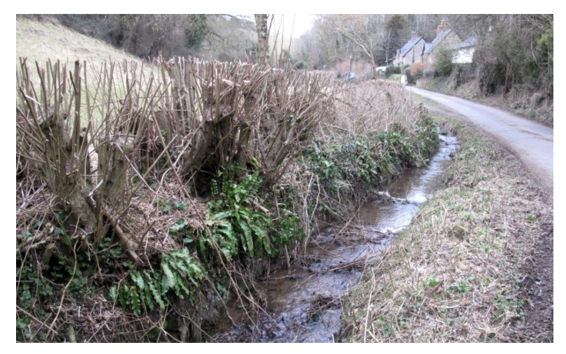
Stream in east of parish