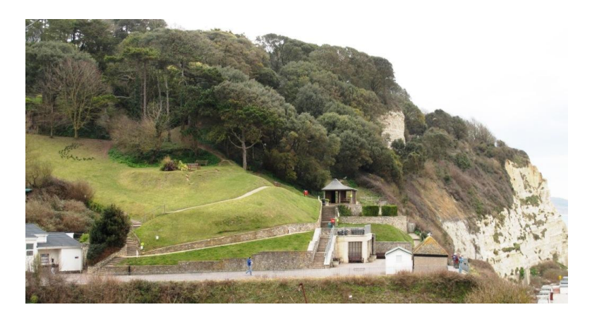
Jubilee Memorial Gardens

The northern boundary has a low bank with some English elm. Along some of this there is an ornamental hedge but there is also part with ivy, bramble, alexanders, stinking iris and lord's-and-ladies growing on or at the base of the bank. The coastal slope in the south supported bramble, alexanders, wood sage and English elm.