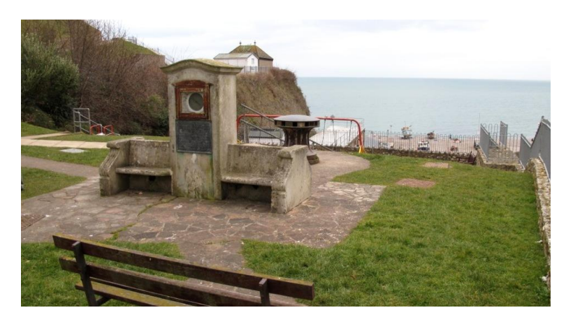
Play area near the Jubilee Memorial Gardens

There is a children's play area in Beer village near the beach and the Jubilee Memorial Gardens. This is a small area surrounded by low stone walls and railings with some grassy areas, which are not of any particular wildlife interest. There is a memorial plaque, a bench, swings and a slide. The vegetation comprises mainly grasses, including cock's-foot, perennial ryegrass and annual meadow-grass with daisy being the main herb species with some white clover. The south-east facing grassy bank half way down the area is very slightly more diverse in species with spotted medick, parsley-piert, ragwort and mouse-ear. The bank to the east supported some sea buckthorn and ornamental shrubs.